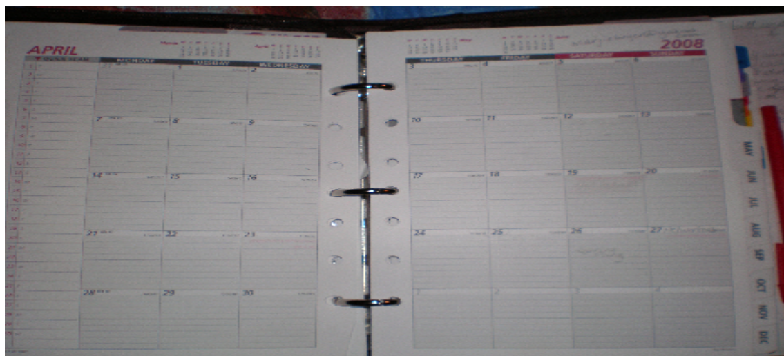
Laura's Schedule for April in Germany!