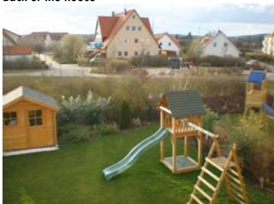
View from rear balcony