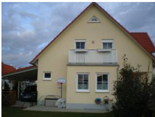
Back of the house